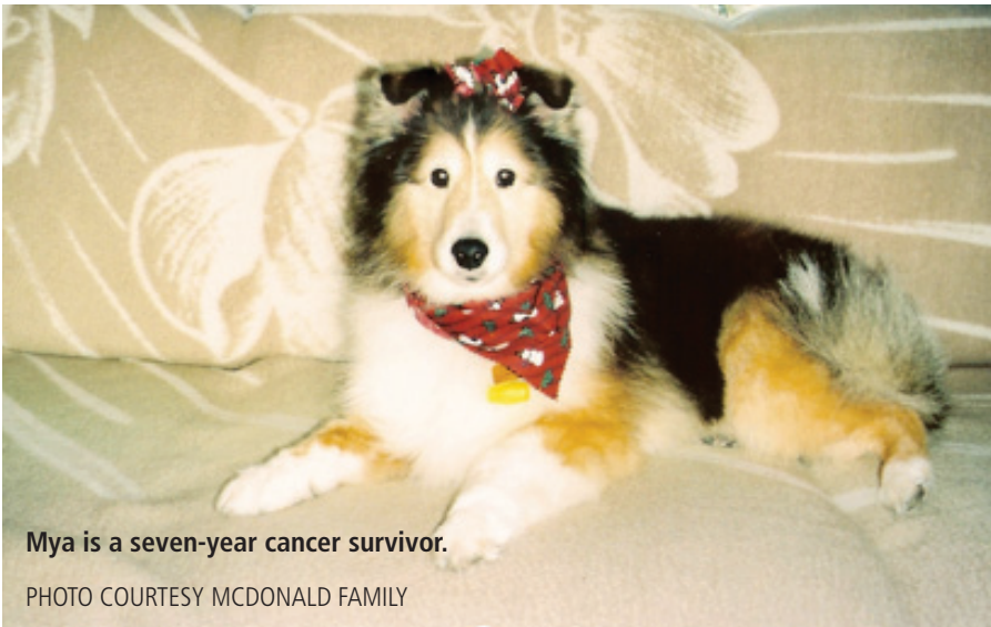
Mya is a seven-year cancer survivor.